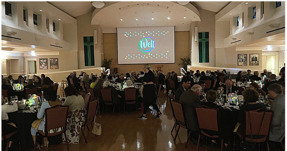
It was a full house at the Ryan Center at Misericordia House on November 4th