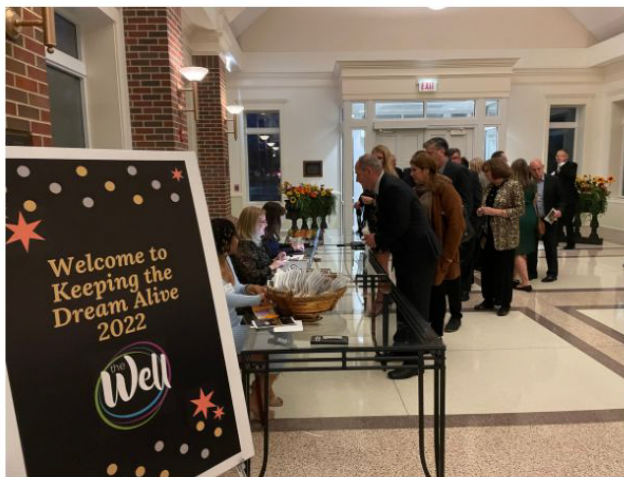
Guests arriving at the Ryan Center are greeted by our volunteers